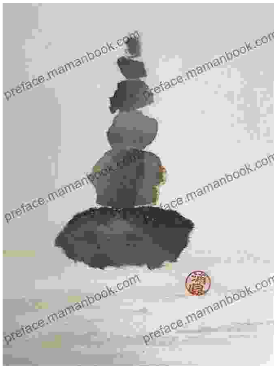
Haiga Drawing by Horacio Magnus

Magnus's Haiga drawings are characterized by their simplicity, elegance, and profound emotional resonance. Through the delicate interplay of brushstrokes and the evocative power of Haiku, he captures the fleeting moments and subtle nuances of the natural world, inviting viewers to connect with the beauty and wisdom that surrounds them.