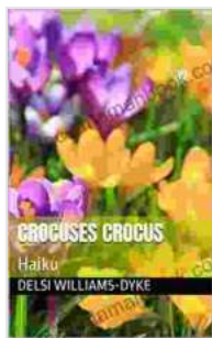
Image Alt Attributes: * **crocus_field:** A field of vibrant crocuses blooming in a meadow * **close_up_crocus:** A close-up photograph of a single crocus flower, revealing its delicate petals and stamens * **crocus_haiku_etched_in_stone:** A stone etching of William Blake's crocus haiku, inscribed on a garden bench * **crocus_cultivation_diagram:** A diagram illustrating the proper depth and spacing for planting crocus bulbs in the garden

moment and find joy in the beauty that surrounds us. Their fleeting bloom may be a reminder that all things must pass, but their enduring legacy as symbols of hope and renewal fills us with a sense of optimism and the promise of brighter days to come.